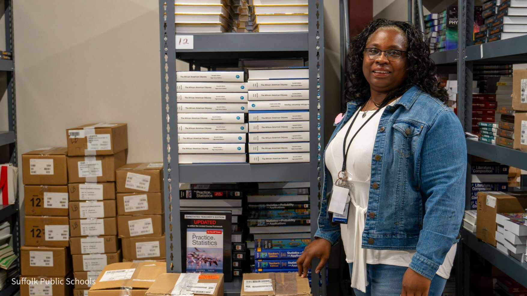
Suffolk Public Schools